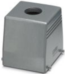
HEAVYCON sleeve housing B32, for double locking latch, height 80 mm, without support 1x M32, straight conductor exit

Please be informed that the data shown in this PDF Document is generated from our Online Catalog. Please find the complete data in the user's documentation. Our General Terms of Use for Downloads are valid ( http://phoenixcontact.com/download )