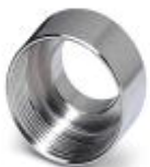
Step-up adapter, M32 to M40, including O-ring

Extension adapter - ENLAR-M-KV-M32/M40 - 1647682