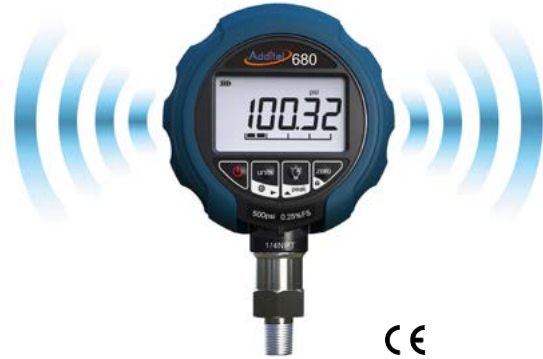
680 with data logging and wireless (optional)