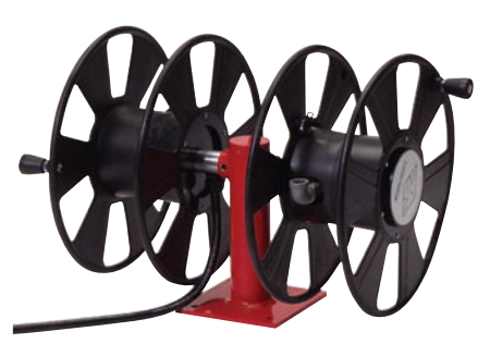
Side-by-side combinations T-2462-0

Ideal for applications where space, weight and flexibility are key, these reels are designed for manual winding of air/water/fuel gases hose, electric cord and welding cable. Versatile in function, select configurations to suit specific needs. Safe-T-Reels offer trouble-free management of large capacities of hose or cord.