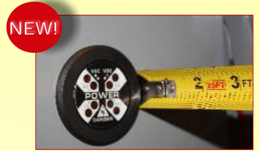
Dimensions of the Bezel - Diameter: 2.25" Outside cabinet depth: .20" Inside cabinet depth: 3.50"