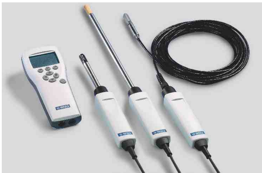
The Vaisala HUMICAP® Handheld Humidity and Temperature Meter HM70 is a high-performance, portable humidity reference. From left to right: MI70 indicator, probes HMP75, HMP76 and HMP77.

The Vaisala HUMICAP® Handheld Humidity and Temperature Meter HM70 is designed for demanding humidity measurements in spot-checking applications. It is also ideal for field checking and calibration of Vaisala's fixed humidity instruments.