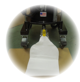
5 micron discharge filter assembly safely collects chips and sludge