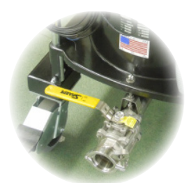
Stainless steel discharge ball valve for easy emptying of liquids and materials

1.5" ID x 10" Urethane, Fully Grounded, Static-Conductive, NFPA Compliant Hose w/ Two 1.5" Molded Cuffs; Exclusive 16" Conductive Rubber Floor Tool w/ Replaceable Bristles and Squeegee; 54" Aluminum Two Piece Wand; 11" Aluminum Crevice Tool; 3" Round Static-Conductive Brush w/ Carbon Impregnated Nylon Bristles; 2" Button Lock Reducer x 1.5"