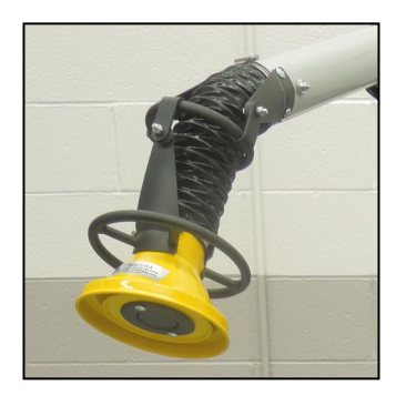
Wide capture hood radius and handle allow for quick and easy point of source positioning