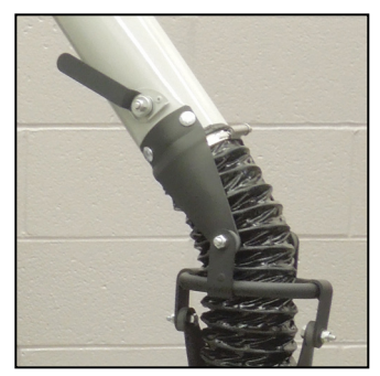
Regulator lever adjusts the level of air flow through flex arm